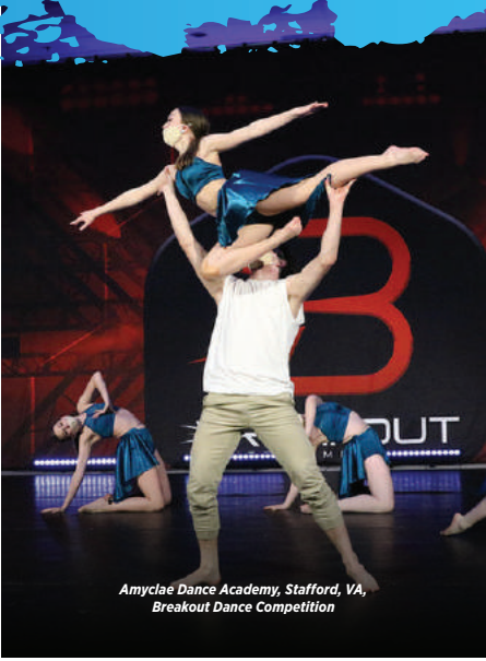
Amyclae Dance Academy, Stafford, VA, Breakout Dance Competition

Since 2014, ADCC Members have presented ADCC Studio of Excellence Awards (SOE) at their regional and national competitions, to studios that exemplify the values of The ADCC , including working together and striving for excellence.