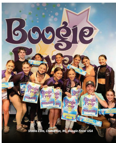
Studio Elite, Cramerton, NC, Boogie Fever USA