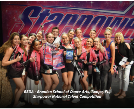
BSDA - Brandon School of Dance Arts, Tampa, FL, Starpower National Talent Competition