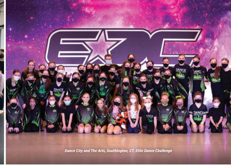
Dance City and The Arts, Southington, CT, Elite Dance Challenge