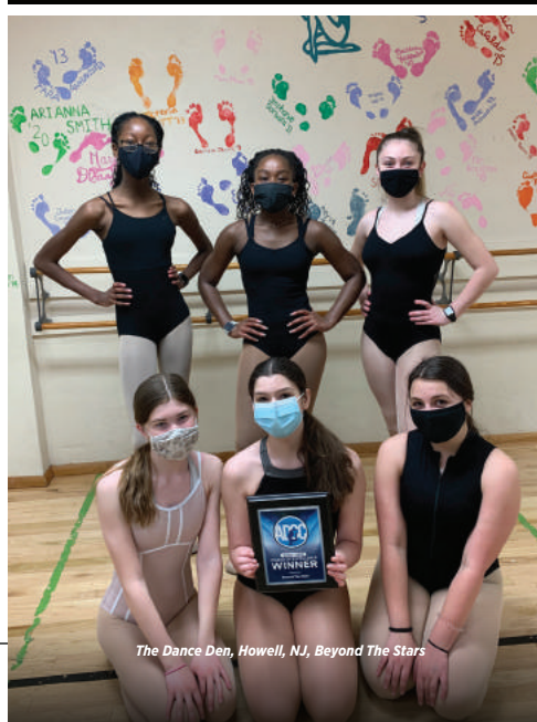
The Dance Den, Howell, NJ, Beyond The Stars