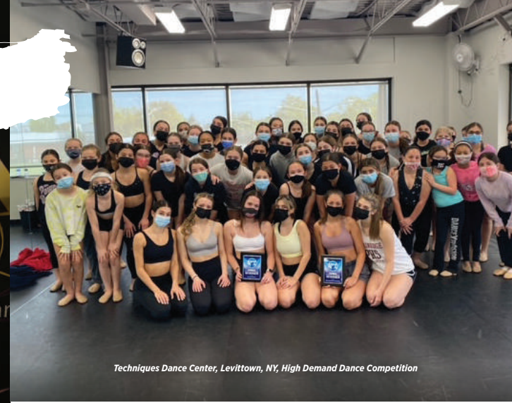
Techniques Dance Center, Levittown, NY, High Demand Dance Competition