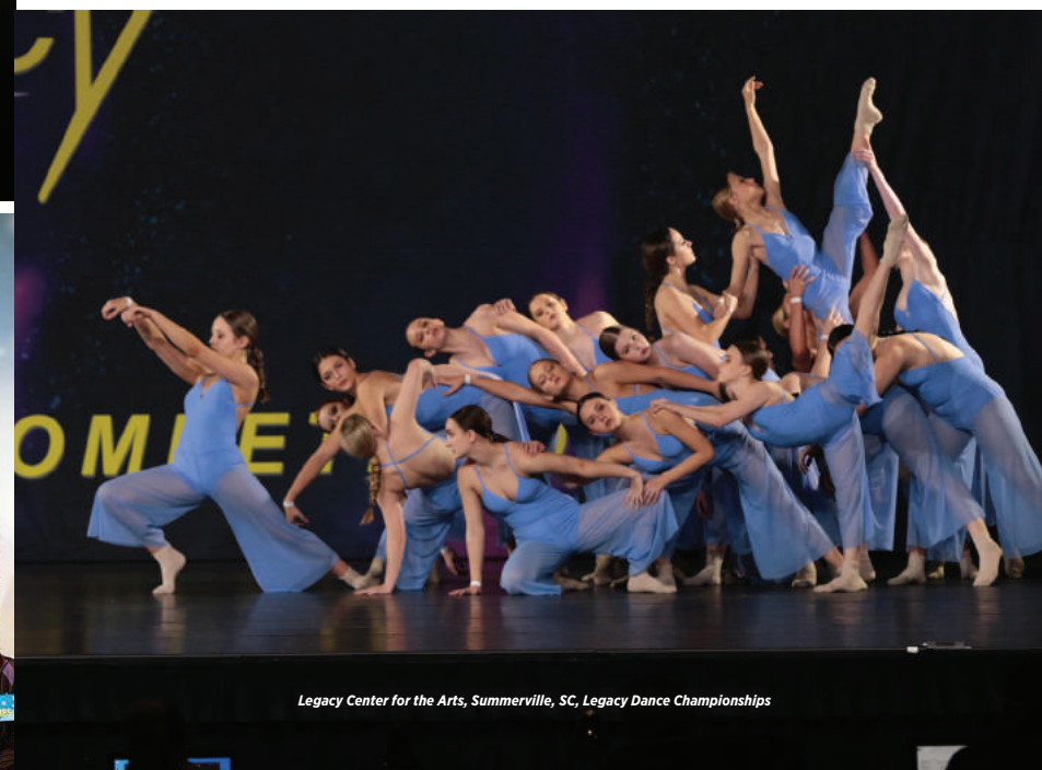
Legacy Center for the Arts, Summerville, SC, Legacy Dance Championships