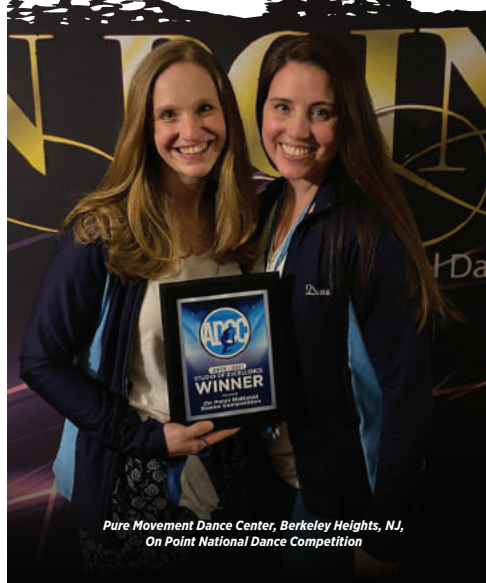
Pure Movement Dance Center, Berkeley Heights, NJ, On Point National Dance Competition