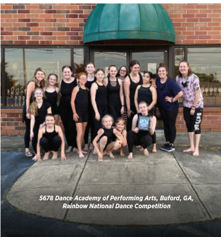
5678 Dance Academy of Performing Arts, Buford, GA, Rainbow National Dance Competition