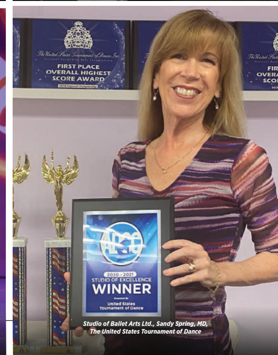
Studio of Ballet Arts Ltd., Sandy Spring, MD, The United States Tournament of Dance