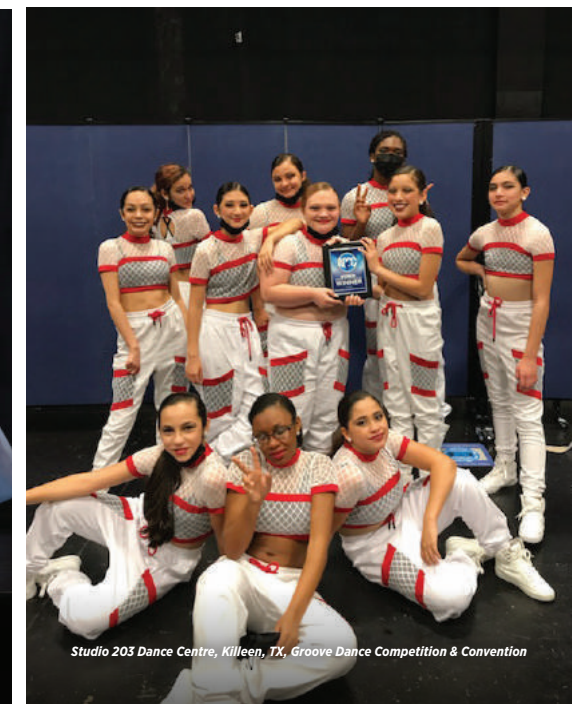
Studio 203 Dance Centre, Killeen, TX, Groove Dance Competition & Convention