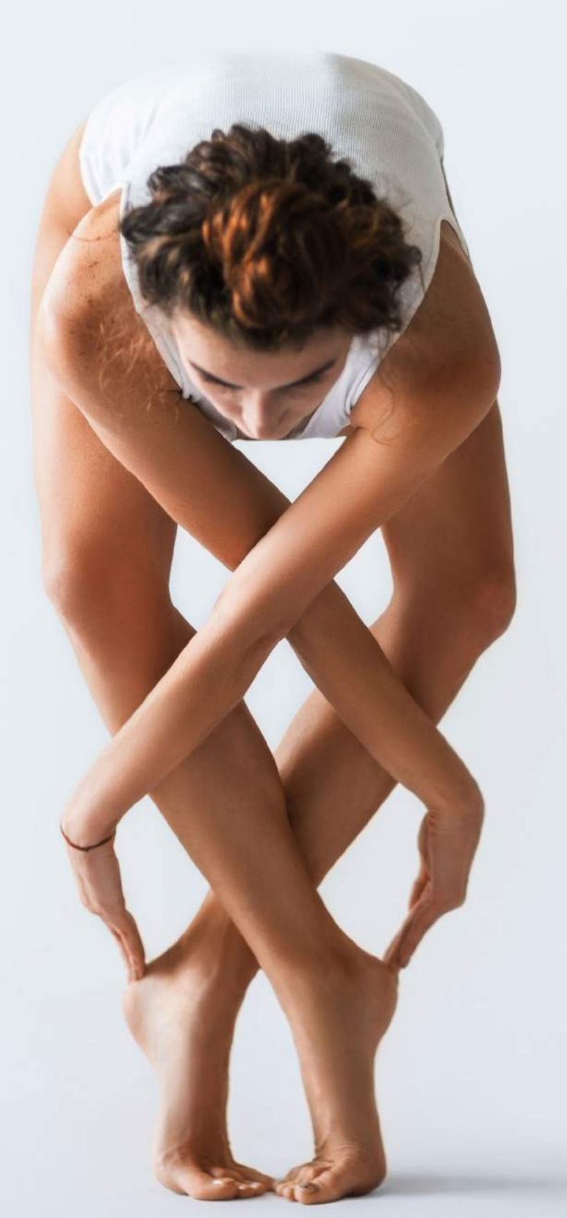
More than a competition. An experience!