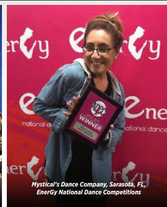
Mystical's Dance Company, Sarasota, FL, Energy National Dance Competitions