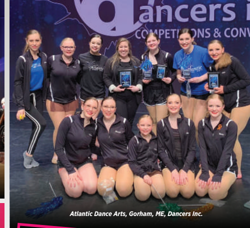
Atlantic Dance Arts, Gorham, ME, Dancers Inc.