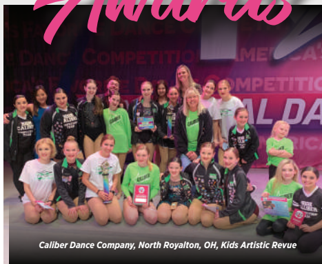
Caliber Dance Company, North Royalton, OH, Kids Artistic Revue

Since 2014, ADCC Members have presented ADCC Studio of Excellence Awards (SOE) at their regional and national competitions, to studios that exemplify the mission and values of The ADCC , including working together and striving for excellence.