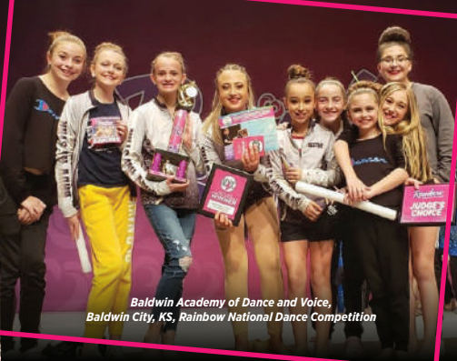
Baldwin Academy of Dance and Voice, Baldwin City, KS, Rainbow National Dance Competition