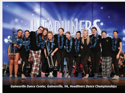
Gainesville Dance Center, Gainesville, VA, Headliners Dance Championships