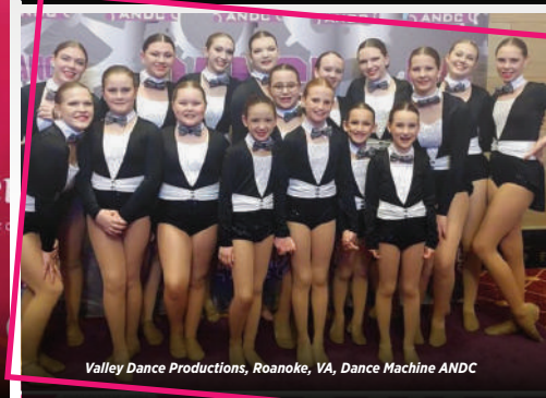
Valley Dance Productions, Roanoke, VA, Dance Machine ANDC