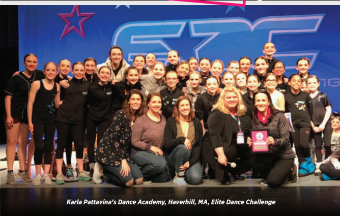
Karla Pattavina's Dance Academy, Haverhill, MA, Elite Dance Challenge