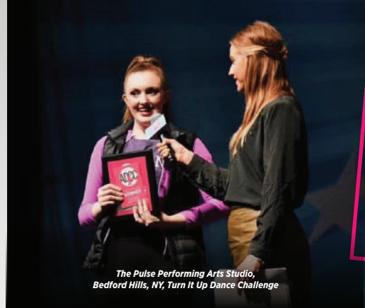
The Pulse Performing Arts Studio, Bedford Hills, NY, Turn It Up Dance Challenge