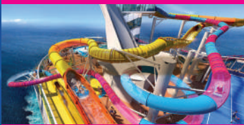
Navigator of the Seas

JANUARY 17-20, 2020 Sailing from Miami, Florida to the Bahamas