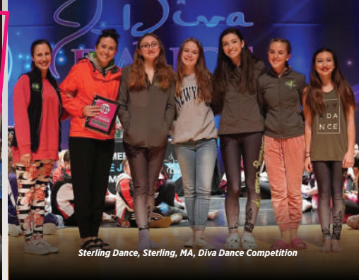
Sterling Dance, Sterling, MA, Diva Dance Competition